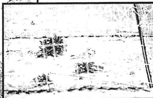
A piping plover nests inside protective fencing called a predator enclosure. Its openings are big enough to let the plover come and go freely but small enough to keep other animals out.

summer if they should apply, that ideal is unlikely to be realized this year. So are some others, like a full staffing level.